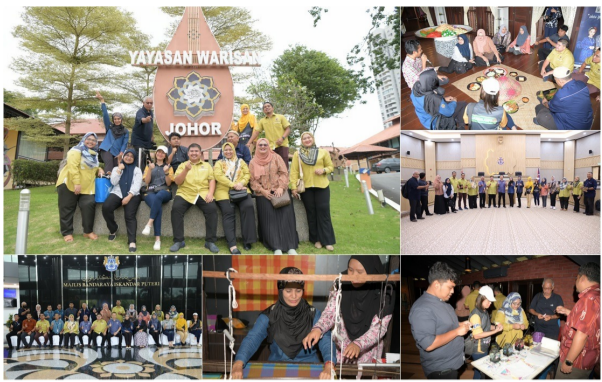
LADA to focus on cultural tourism development next year