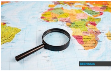
Dancing in, dissent out as Saudi Crown Prince transforms his country