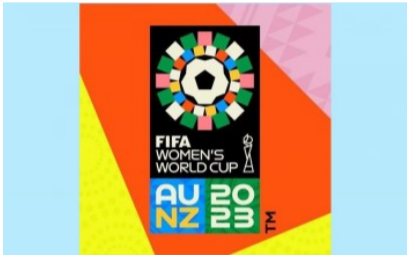
First Palestinian referee to officiate at FIFA Women's World Cup