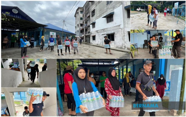
Residents seek immediate solutions after six months of water disruption